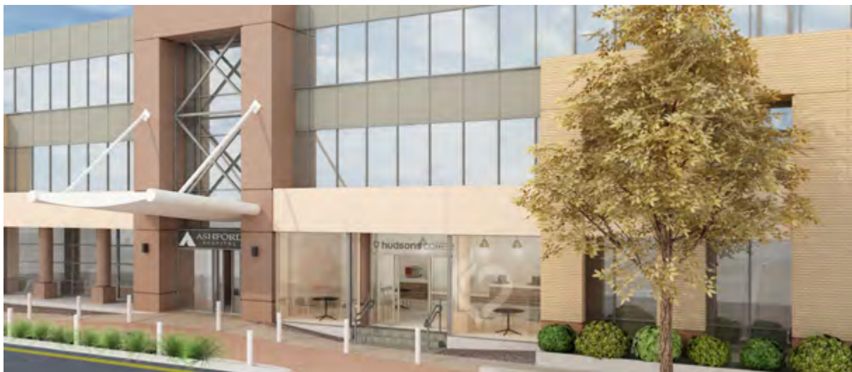
Refurbishment of main entrance - concept image