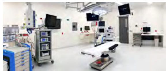
New additional operating theatre and refurbishment of recovery (completed April 2018)

We appreciate your patience and flexibility during this project. Works are expected to take approximately 18 months to complete.