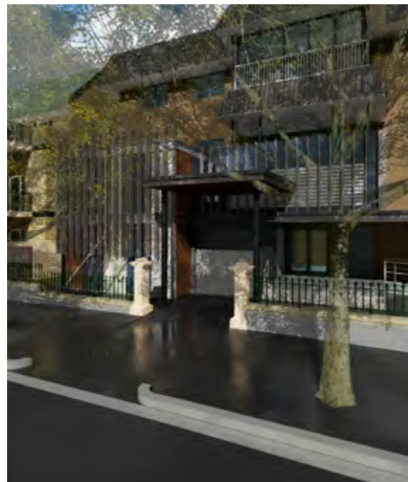
Expansion of Pennington Terrace storage - concept image (commenced November 2018)