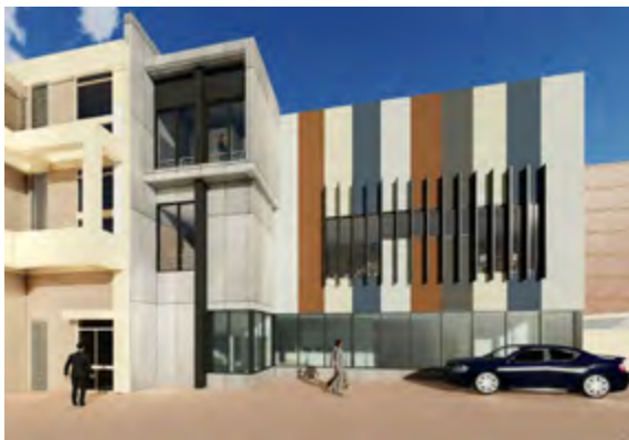
New Paediatric Day Stay Unit entrance - concept image (commenced November 2018)