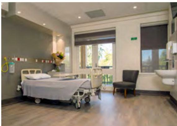
Refurbishment of patient accommodation (Stage 1 completed)