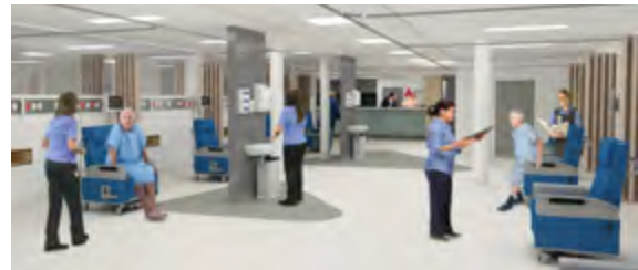
New Day Procedure Unit - concept image