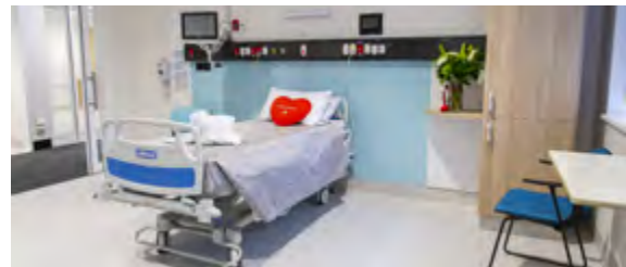
New six bed Chest Pain Unit (completed October 2018)