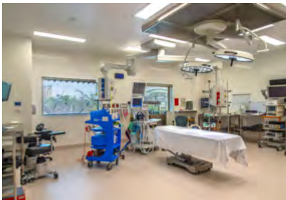
New additional operating theatre (commenced November 2018)