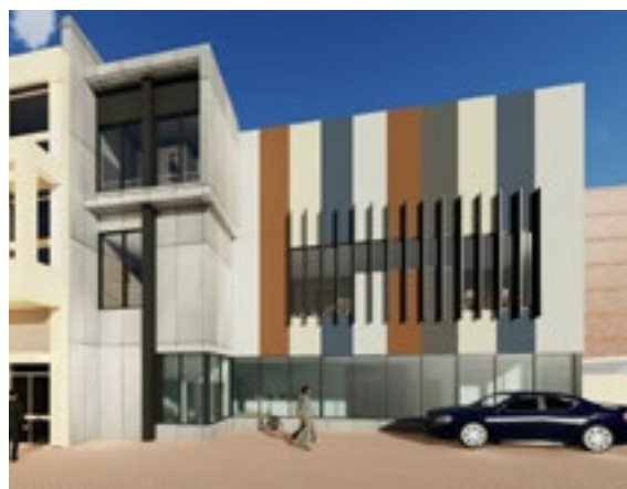
Paediatric Day Stay Unit - concept image