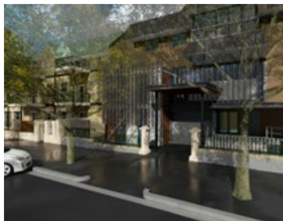
Pennington Terrace - concept image