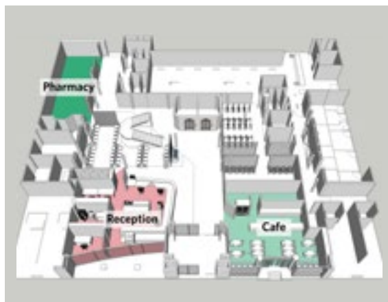
Ground floor / reception - concept model

We appreciate your patience and flexibility during this project. Works are expected to take approximately 18 months to complete.