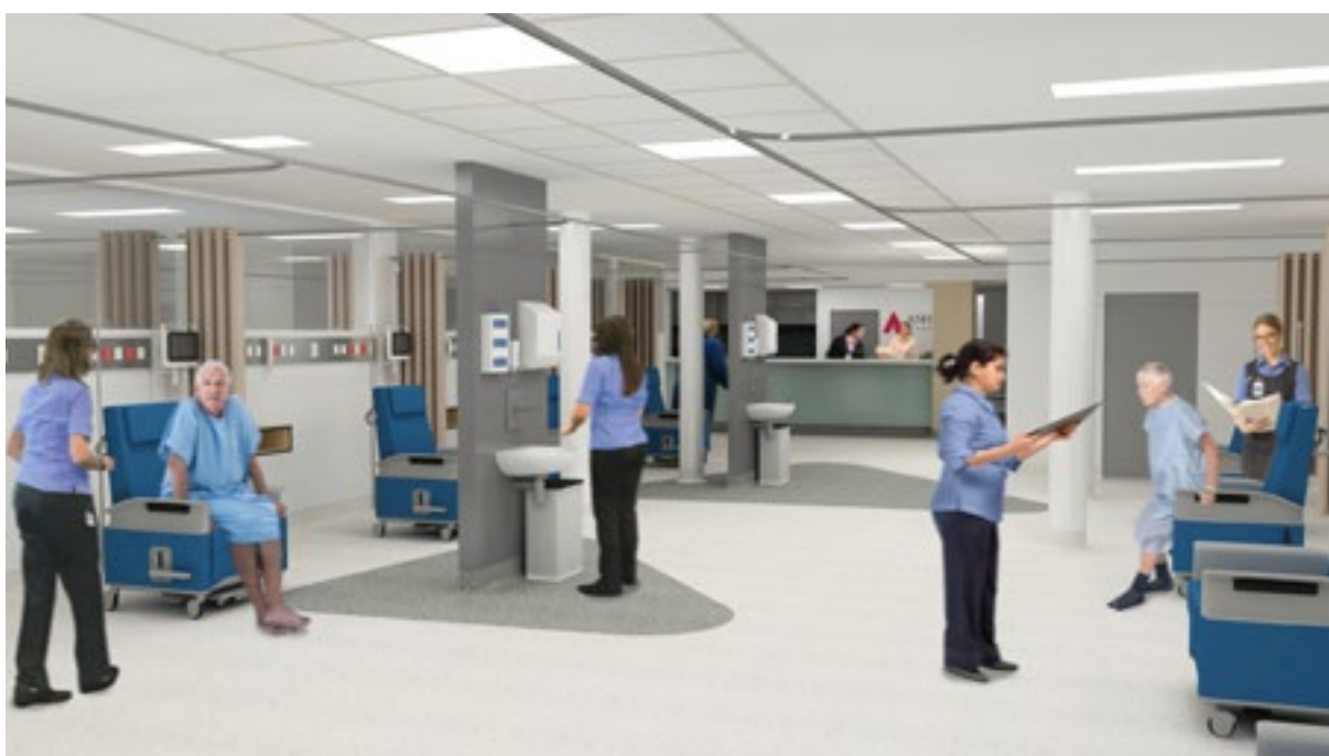
Day Procedure Unit - concept image