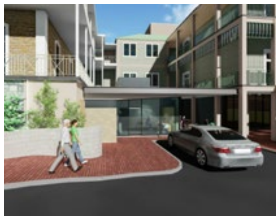
Consulting suite - concept image

The development will take approximately 18 months to complete. We welcome any feedback and thank you for your patience during the process.