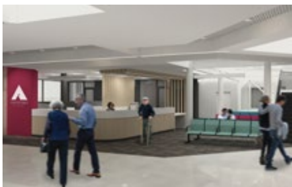
Ground floor / reception - concept image