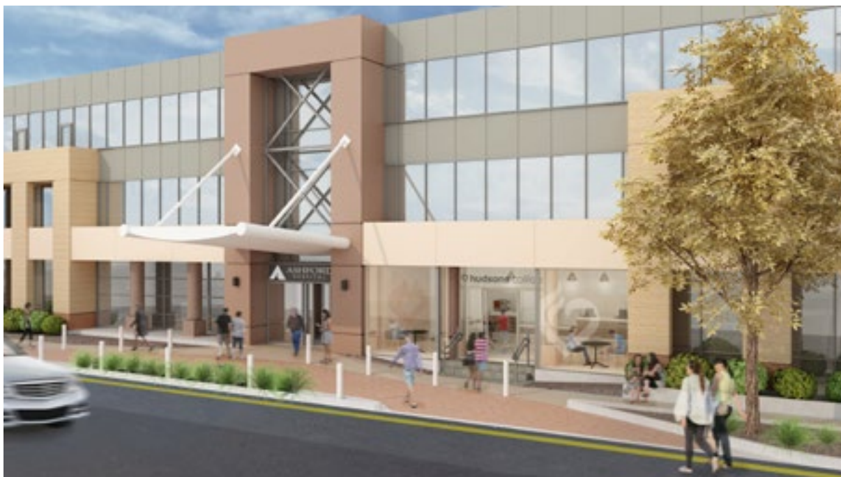
Main entrance (Marlestone Avenue) - concept image