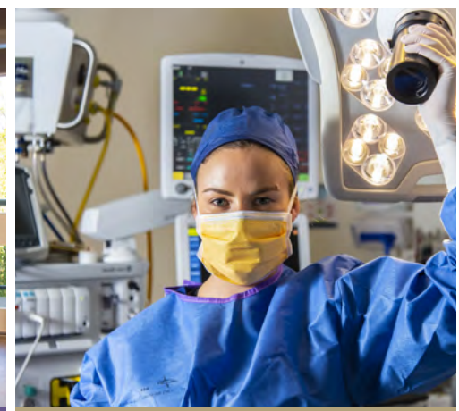
Our 32 operating and procedural suites provide care across all surgical specialties.