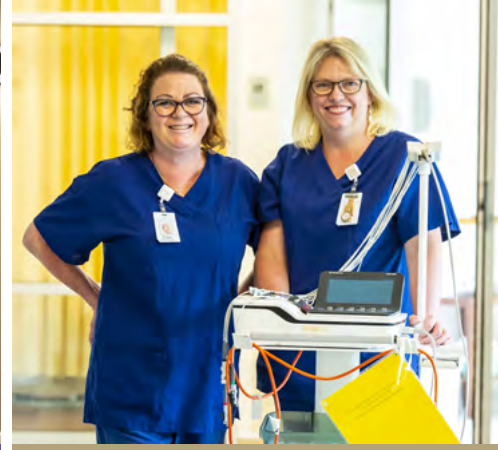
With our on-site Medical Officers and three Critical Care Units, we care about the safety of your patients.