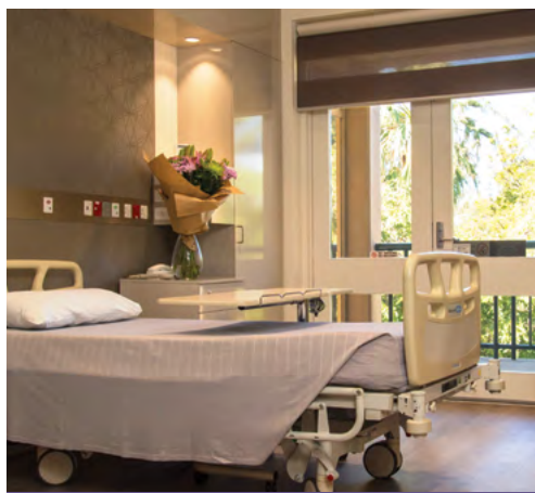
With close to 500 beds, we care about the comfort of your patients.