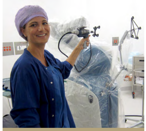
We care for your patients with the latest in medical technology.