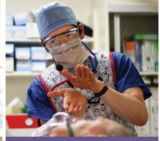
We work with over 1,400 caring Doctors.